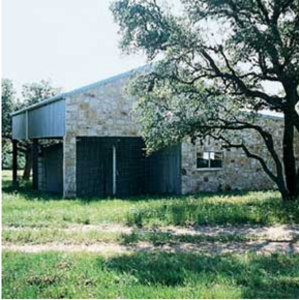
Cleverly disguised in this country building are 10-foot storage tanks, a pump and some small filters.