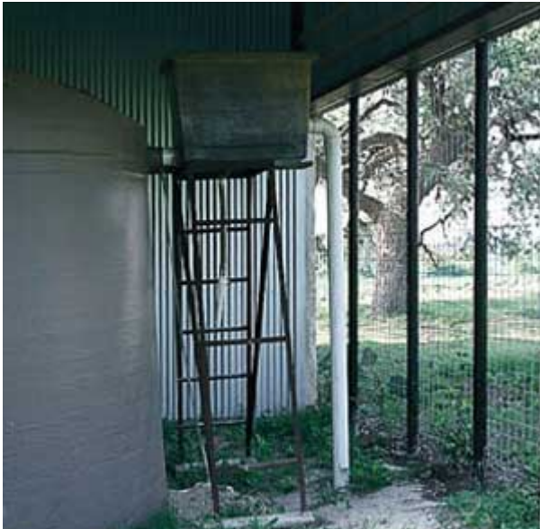
The box attached to the top of the tank is a primary filter, removing large debris.