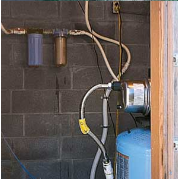
This is as sophisticated as even a large water-collection system gets. Filters, a pump, and a pressure tank.